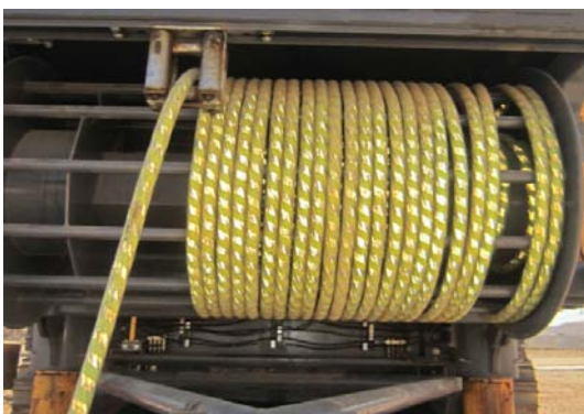
Fig. 5. Multi-spiral reel or cylindrical drum.