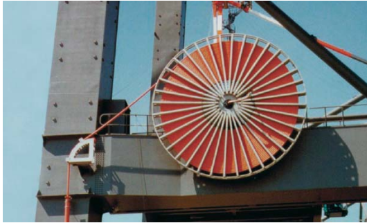
Fig. 3. Monospiral reel or radial drum (Ventilated)

Depends on the machinery specification and its applications, there are several cable reel types. In the next pictures appear some common cable reels.