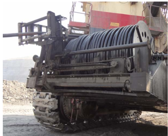
Fig. 6. Multi-spiral and multi-layer reel or cylindrical drum.