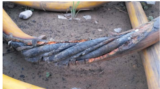
Fig. 1. Cores deterioration in a trailing cable.

After withstanding repeated exposure to temperatures exceeding the normal operating temperature rating of the insulation, breakdown or deterioration of the conductor's insulation and the overall jacket will result. Degraded cable insulation can result in a short circuit that may cause a fire or explosive release of energy.