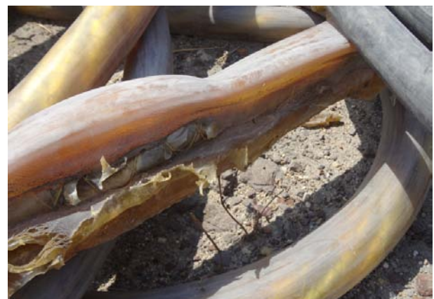
Fig. 2. Polyurethane jacket melted by overheating.